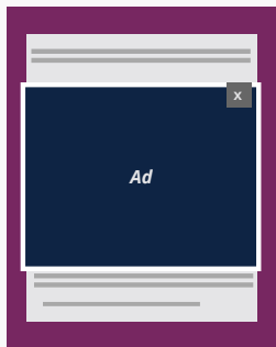
Full Page Pop-Up 1200 x 900 (desktop) 300 x 300 (mobile) 8.5" x 11" (PDF Download)